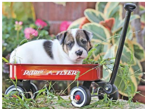
Spurs is a puppy who needs a family to love.

Saving one animal won't change the world, but the world will surely change for that animal. •