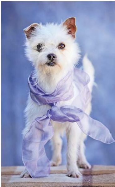
Lovey's favorite place is your lap.

Lovey is the sweetest dog ever! She was found as a stray in an empty lot with her two puppies; her owners were never located. Lovey is wonderful with all other dogs, loves all people and would like nothing better than to just hang out in your lap. She is very sweet, very smart and a very quick learner. With her cheerful personality, Lovey's tail is always wagging. She loves going for walks and is up for whatever outing you have planned. Lovey is spayed, current on vaccinations, microchipped, and fine with other dogs.