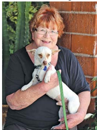
Radar is settling in and loves his new family and all the friends that he is meeting there!