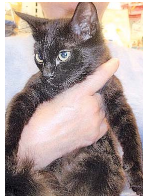
JellyBean is a great addition to a pet family.

Be kind. Save a life. Support animal rescue. •