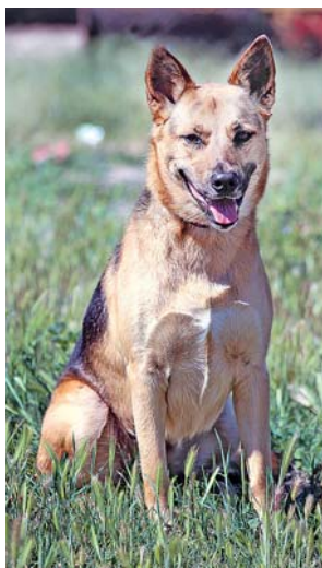
Jackie loves walks and family time.

Jackie is a beautiful 3 year old Shepherd/Lab mix. She was found as a stray and microchipped, but the people at the address she was registered to denied knowing her.