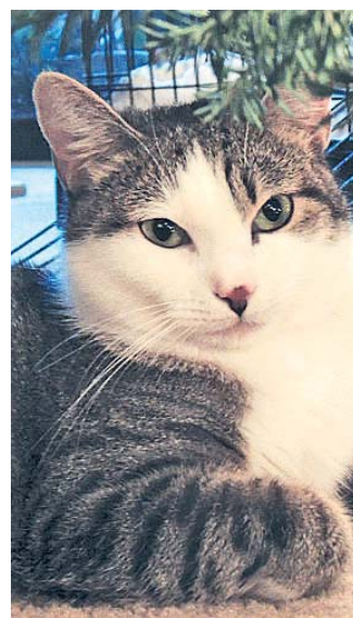
Arwen loves to be petted in a calm environment.

JellyBean is one very lucky kitten. He was discovered in a car engine, and his foster mom fished him out and cleaned him up. With his fluffy black coat, Jellybean is going out of his way to prove that black cats are lucky! And as if his handsome licorice coloring wasn't enough, he has developed hints of a white undercoat giving him a smoky appearance that is just too adorable for words. JellyBean absolutely loves other cats and even dogs. He is the perfect companion for a lonely cat as he is very high energy due to his youth. If you don't already have a kitty companion for him, Jellybean would love be adopted with Charleze, a gorgeous black female kitty who has adopted JellyBean as her baby or with fluffy grey kitten Constantine, who became his kitten companion upon his own rescue.