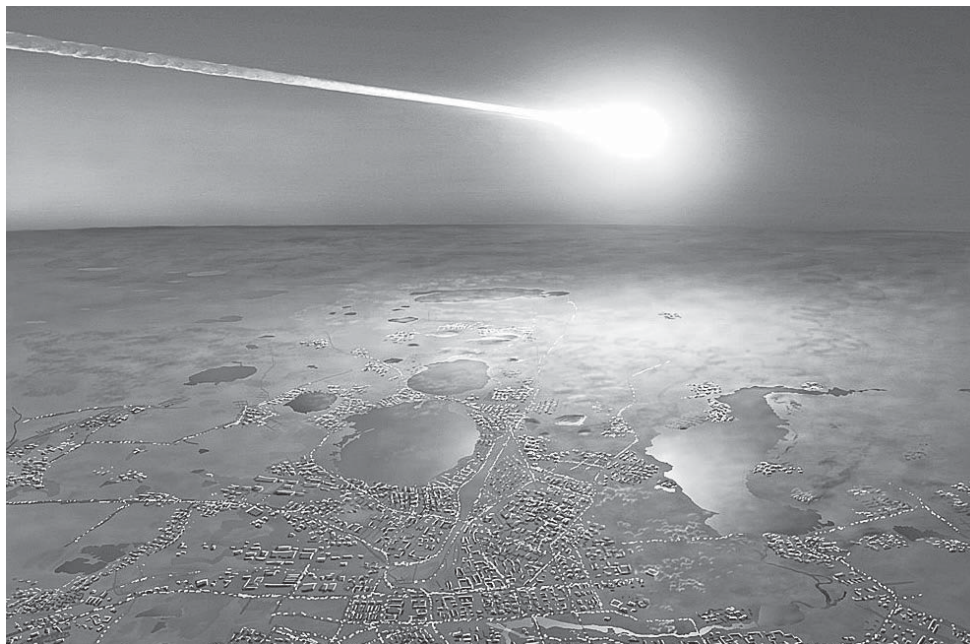
An artist's view of the Chelyabinsk "superbolide" event shows the meteor fragment which exploded over Russia last year. Credit: Don Davis for space.com

Between 2000 and 2013, this network detected 26 explosions on Earth ranging in energy from 1 to 600 kilotons—all caused not by nuclear explosions, but rather by asteroid impacts. To put that in perspective, the atomic bomb that destroyed Hiroshima in 1945 exploded with an energy impact of 15 kilotons. While most of these asteroids exploded too high in the atmosphere to do serious damage on the ground, the evidence is important in estimating the frequency of